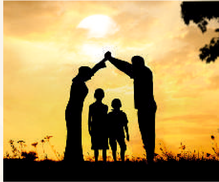
A Beautiful home only at ETIHAD TOWERS...